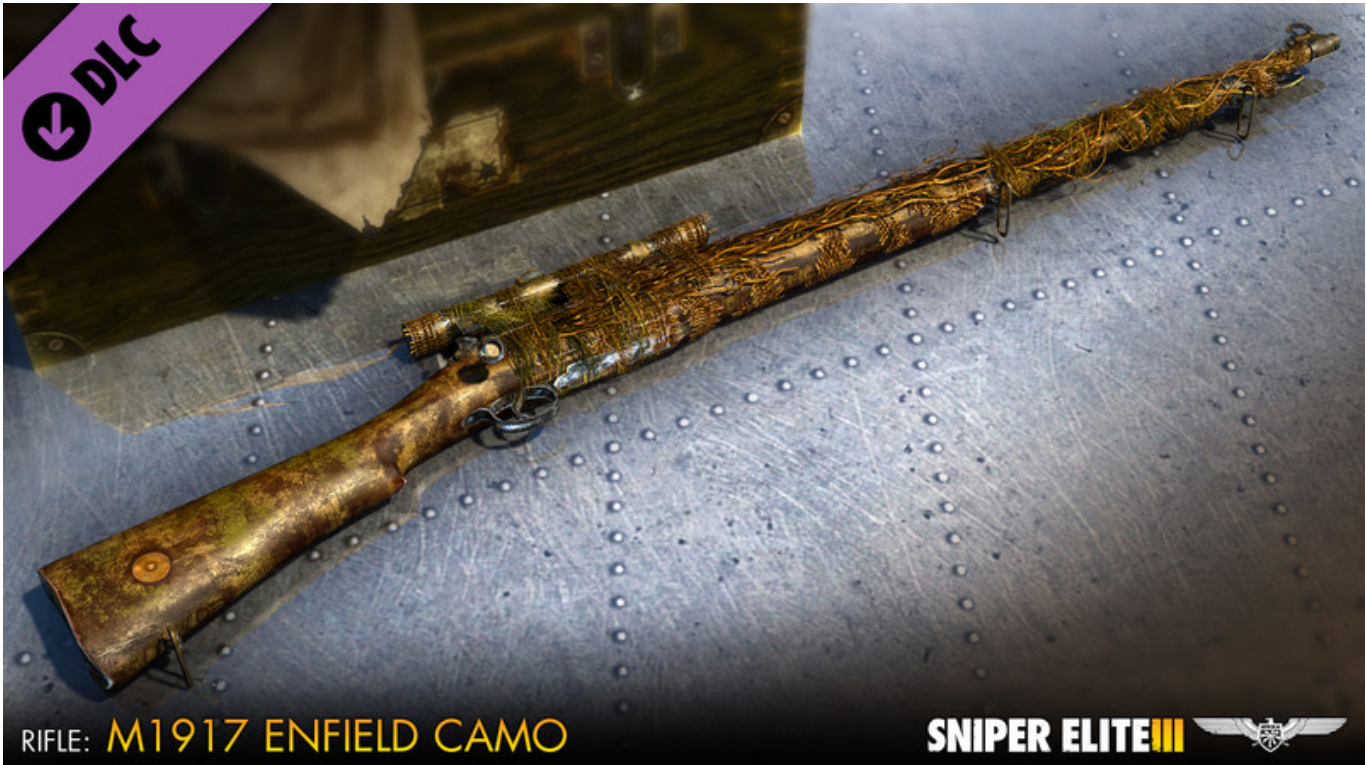
RIFLE: M1917 ENFIELD CAMO